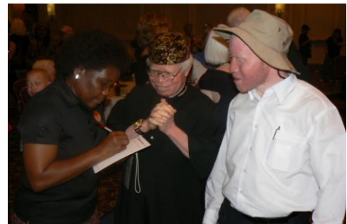
Nigeria and Tanzania meet in DC

For those of us without albinism there was the unique experience of being a minority group to the people with albinism surrounding us. It felt right! For both groups, the deepest expressions of this experience were manifested in tears and laughter as words failed to capture its essence.