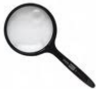
A hand-held magnifier